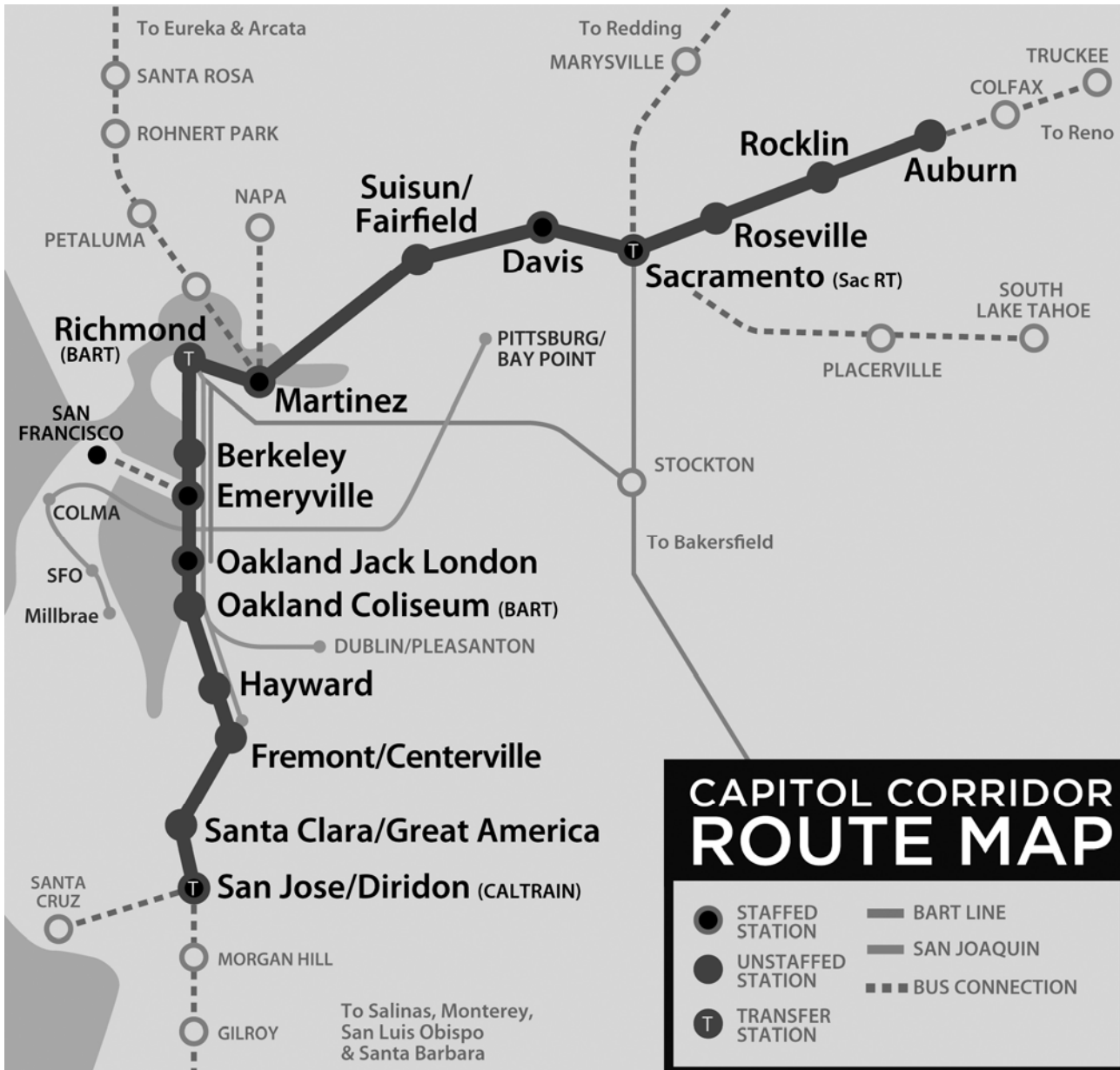
Figure 1-1 Map of Capitol Corridor Service Area

In April 2005, the CCJPA updated its Vision Plan, which identifies short- and long-term goals to guide the operating and capital development plans of the Capitol Corridor during the next five to 20 years. The April 2005 update has been incorporated into this Business Plan.